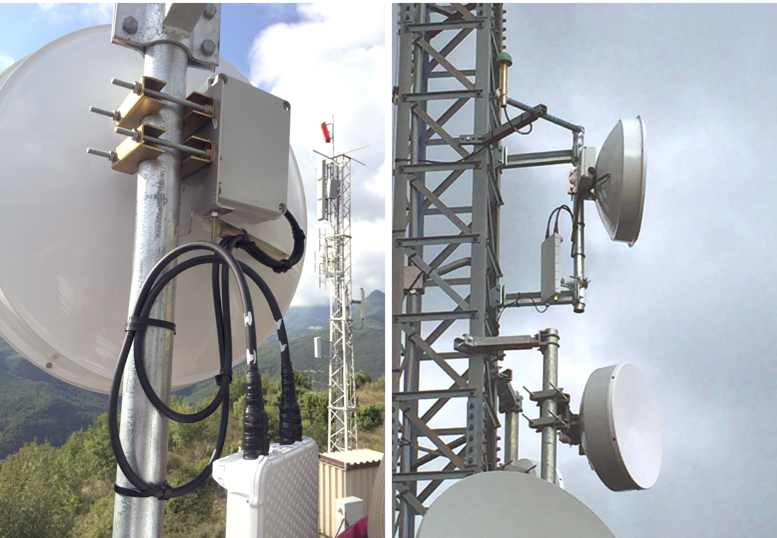
The picture above is one side of the link installed in a Serra di San Quirico municipality

Netoip - an internet service provider from Italy (Ancona region) has decided to participate in the beta testing program of the new LigoPTP RapidFire wireless backhaul devices and set up a 6.5 km (4 mi) link with external dual-pol directional dish antennas. The link is used for the backhaul of a network that connects multiple base stations serving residential and business customers to provide data, VoIP, and video surveillance services.